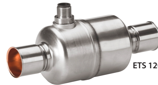
ETS 12C – ETS 24C

Today, ETS Colibri® is a result of our dedication and passion for engineering, built around uncompromised quality and performance. Its focus on energy efficiency ensues from placing great attention to our customers' needs.